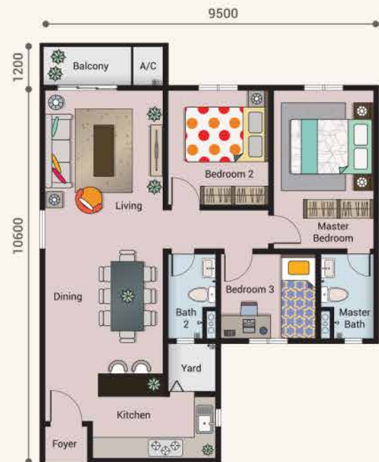
Corner Unit (950 sq.ft.) 3 BEDROOMS | 2 BATHROOMS