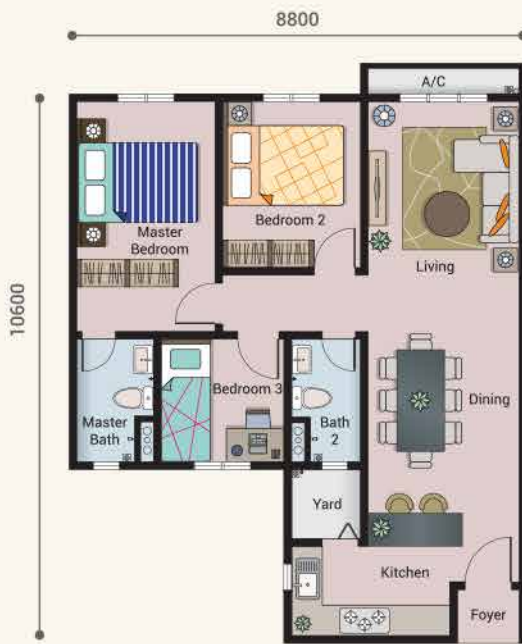
Intermediate Unit (850 sq.ft.) 3 BEDROOMS | 2 BATHROOMS